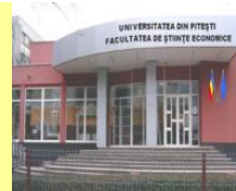
Faculty of Economic Sciences