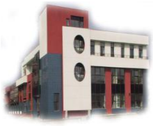
Faculty of Sciences